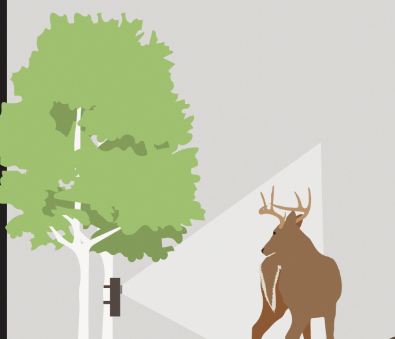
MOOSE, AND ELK WITH TRAIL CAMERAS