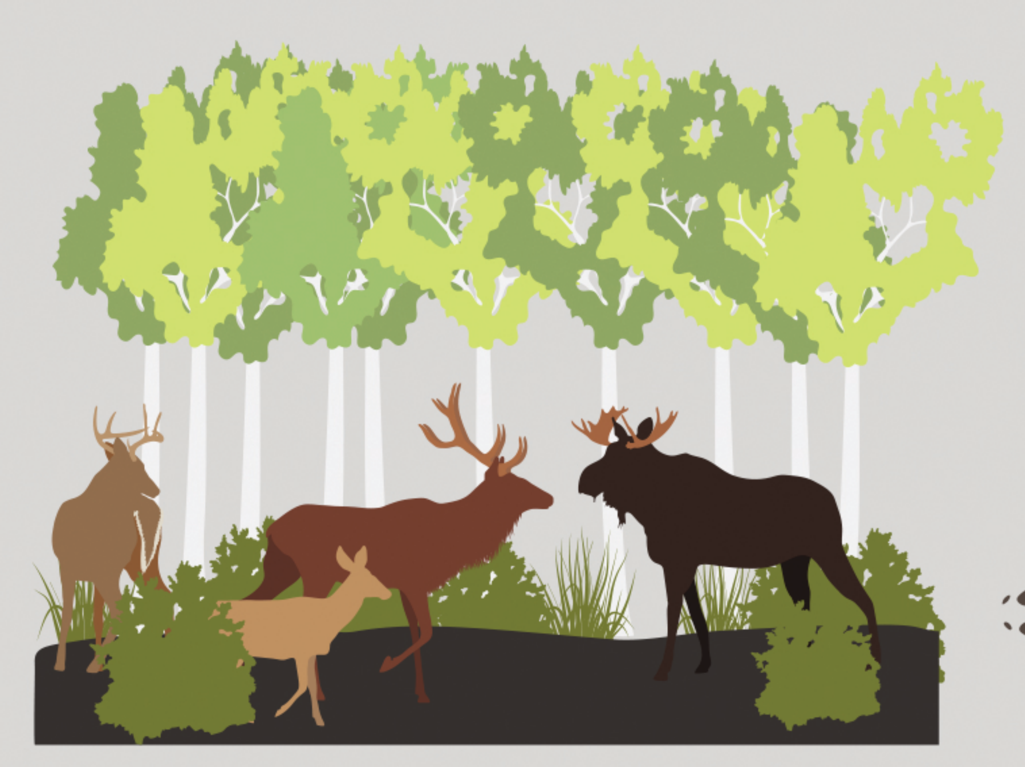
YOUNG FORESTS = MORE MOOSE, ELK, AND DEER