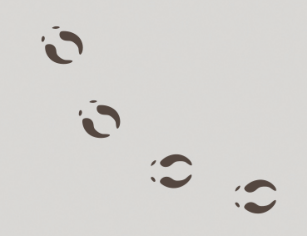
RELATE CUTBLOCK USE BY DEER TO DIFFERENT SILVICULTURAL PRACTICES