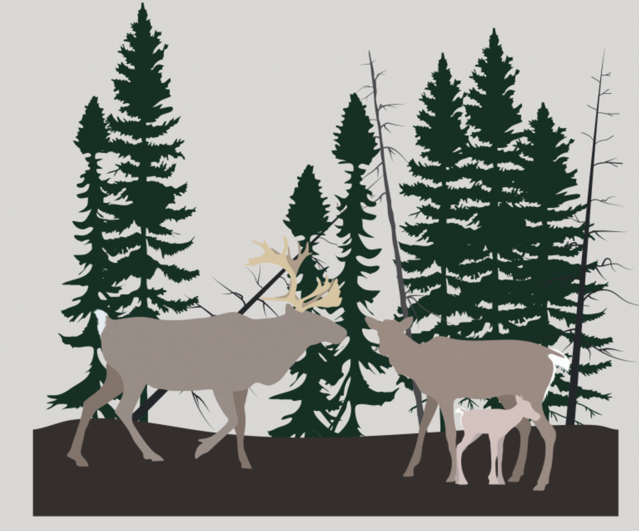
WOODLAND CARIBOU PREFER MATURE FORESTS