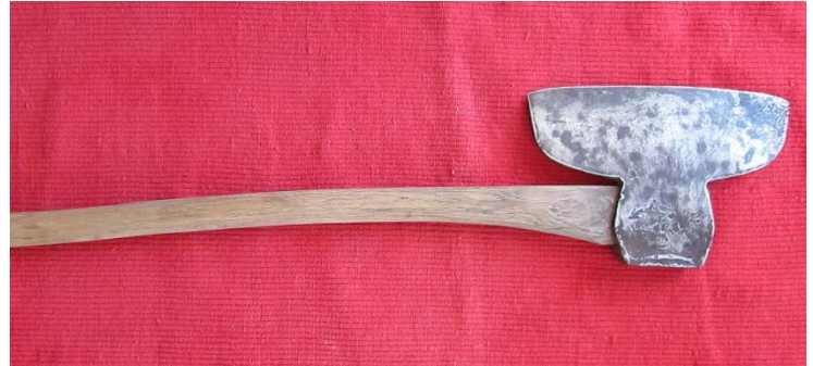
Two Views of a Broadaxe: The beveled side (left) is shaped like a normal axe, and used for chopping and roughing out the tie. The hewing Side (right) has no bevel and is used to chop out a perfectly flat side such as was needed for square timbers or railroad ties.