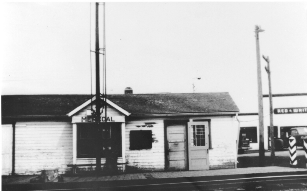
Mercoal Train Station 1940s

You said that he would ship it out by rail, then?