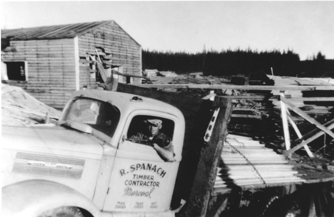
Truck with Lumber—Spruce Mill 1950