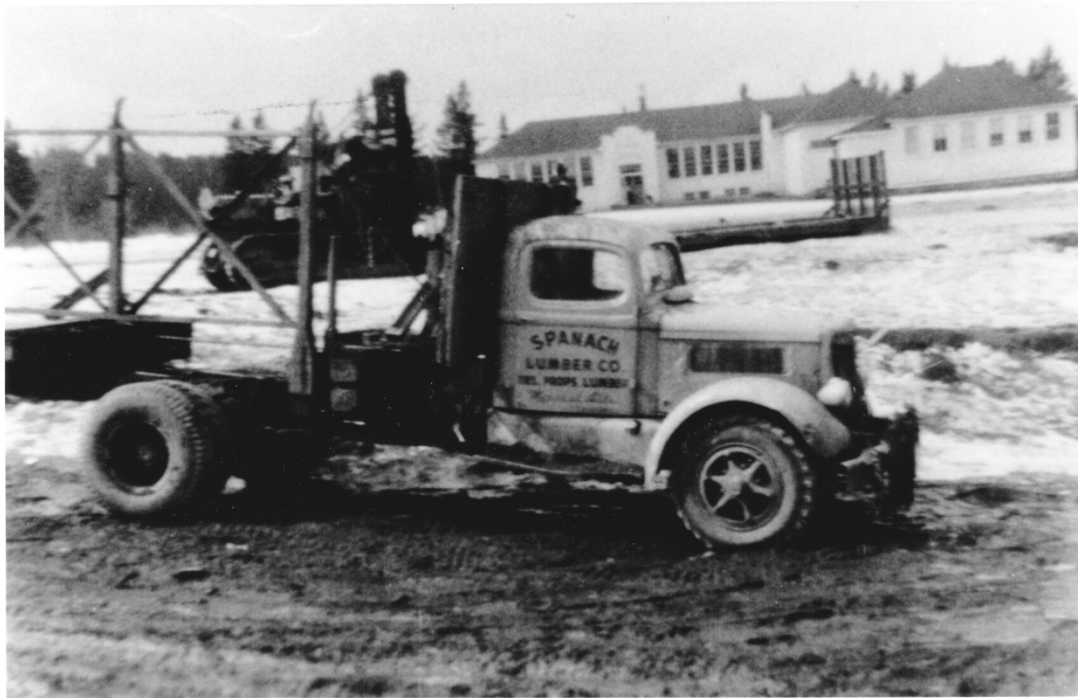
Truck in front of Mercoal School—Mechanical Loader in b/g