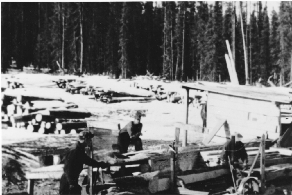
Photo K: this again is the mill (one of the mills, but I am not sure which one or where).