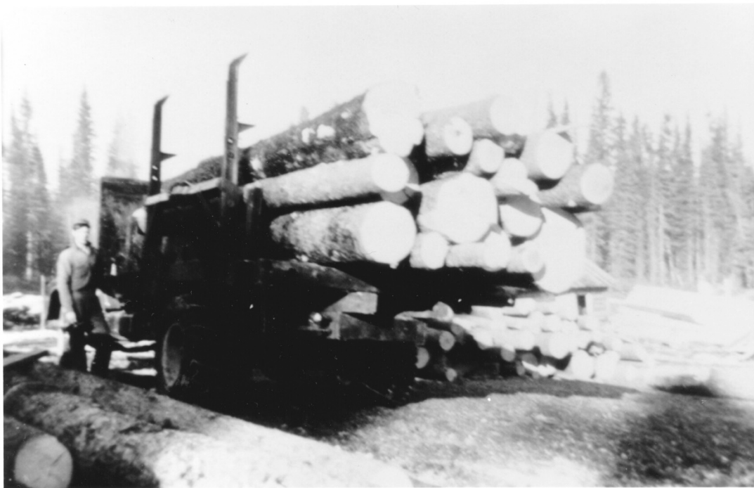
Log Truck with Large Logs—Steeper