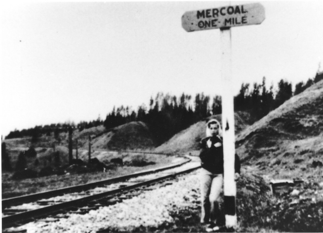
Hiking the Tracks [unknown girl]—Amelia Spanach Collection