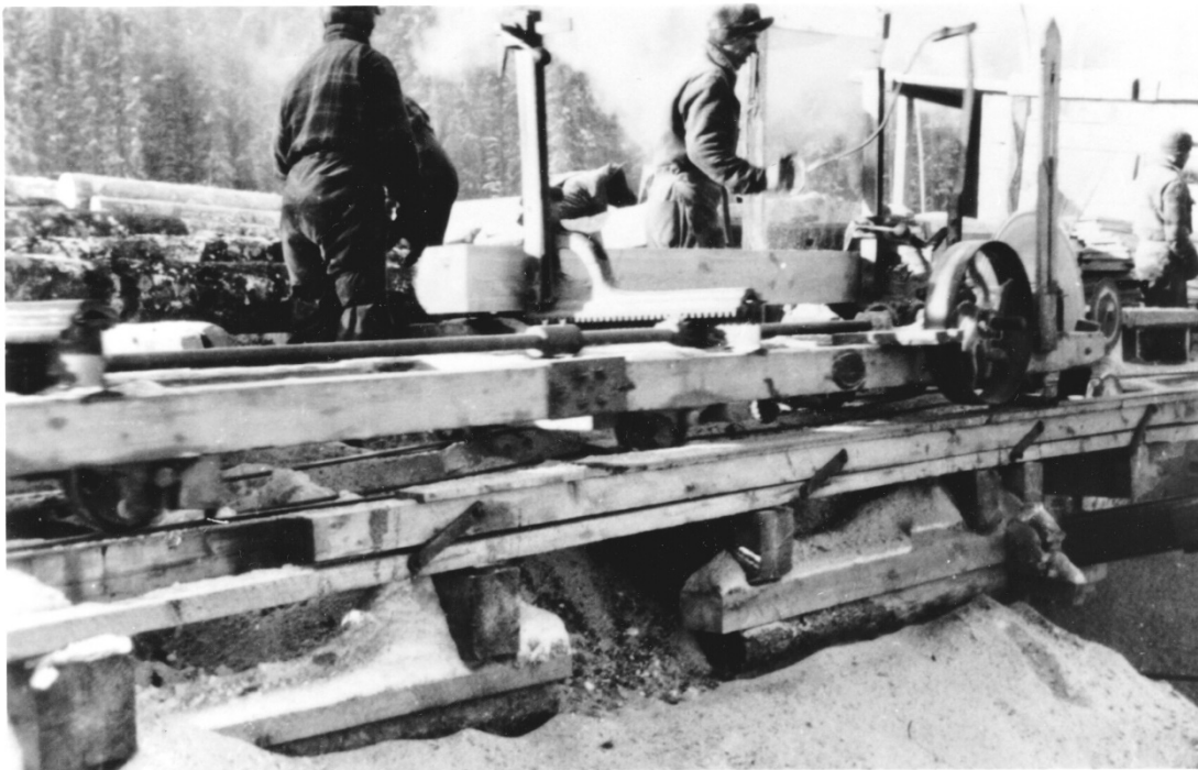
Sawmill at Steeper

That is where he used to load all his stuff and bring it in from the bush during the winter when it was frozen. Then in the spring and summer, he would saw all his CNR ties there, and then after that haul his lumber. And he had a lot of space there where he could store things. But he not only was in the lumber business now. He started expanding because Mercoal was growing by leaps and bounds because it was just a small community with about 100 houses. And then, all of a sudden, they are working around the clock, so they need houses. They need everything. Everybody is coming to him for lumber now. The demand was just up like he was going around the clock. Like the only time I saw him was when he came to eat and have a bath once in a while and check out the mail and stuff. I used to do all his mail because I happened to be better in the English language than he was. He would dictate, and I would do all the writinG So we spent a lot of evenings together catching up on mail. Come morning, he would be off to one of the camps, and I would be at home. We had a gas tank in front of the house, and now the truck drivers would be coming in and filling up—whether they were contracting on their own or working for us, I had to keep track of all this. Or if they needed a meal, I was there to cook it for them and so on. I had my hands full in the home while he had his hands full outside of the home.