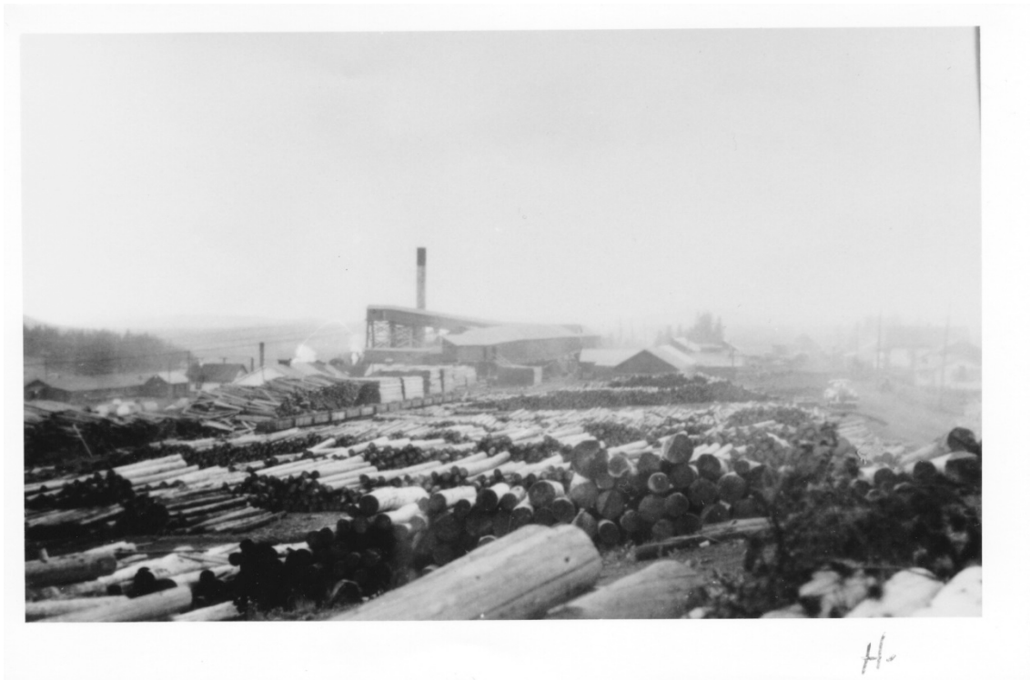
Log Decks at Mercoal Mine 1940s

Photo H1: that is the logs. This was probably during break-up, and somebody needed a bunch of timber, so it was shipped by rail because the trucks couldn't manoeuvre because of the roads.