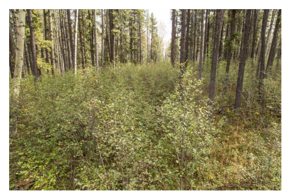
Green alder revegetation throughout this 8m wide line