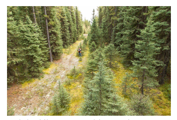
Original line = 8m wide; Moderate regeneration with a new line cut 3m