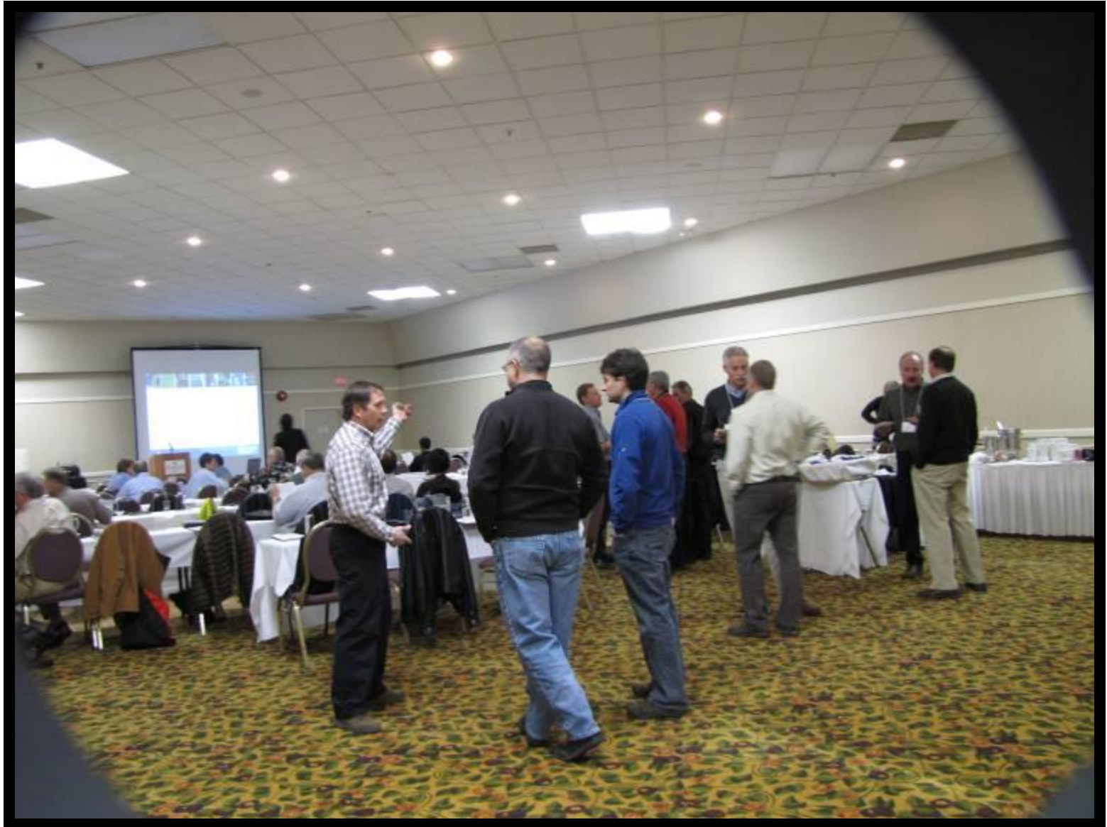
AFGO Forest Offset Workshop #2 May 6, 2010