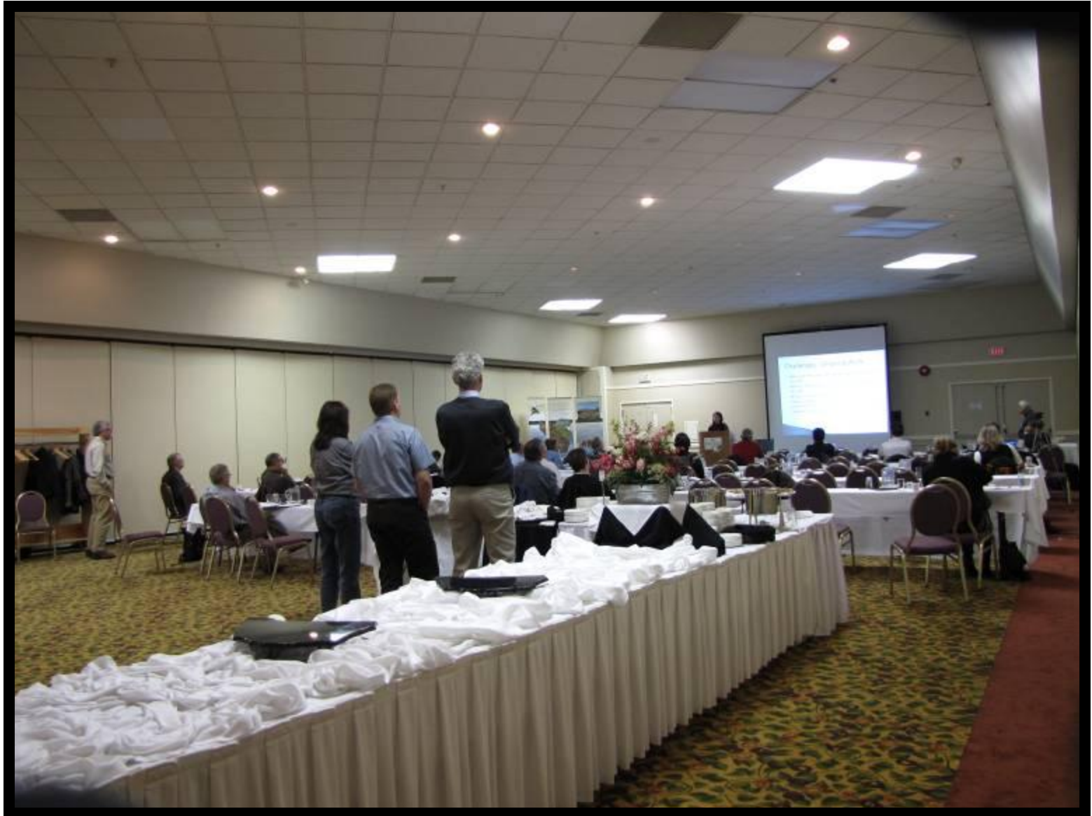
AFGO Forest Offset Workshop #2 May 6, 2010