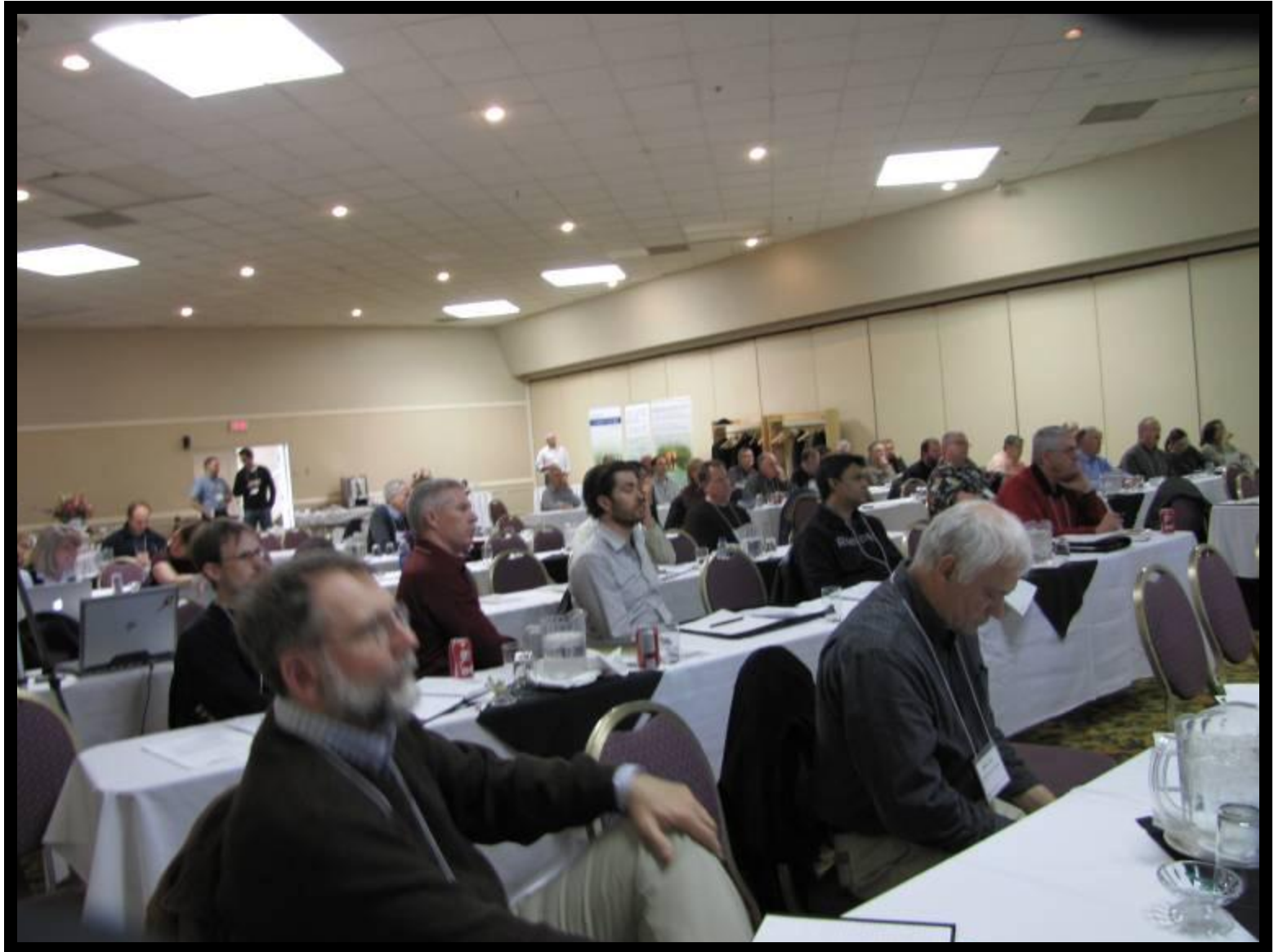
AFGO Forest Offset Workshop #2 May 6, 2010