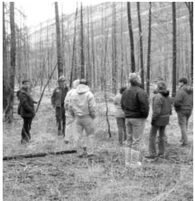
Model forest research is helping to bridge the gap between what is needed ecologically to achieve grizzly bear conservation and what is socially acceptable in terms of land and resource management decisions.

Grizzly bears, which are seen as an indicator of ecosystem health, serve a similar role within the study, functioning as an indicator of more general attitudes people maintain toward resource management decisions. "Because the study places specific emphasis on grizzly bear management we believe it will provide a window into broader concerns surrounding human dimensions of biodiversity conservation," notes McFarlane.