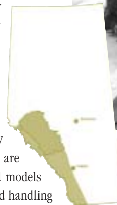
Legend Phase I (1999-2004) Study Area 2004 Expansion Study Area Provincial Boundary

Since the Foothills Model Forest Grizzly Bear Research Program began in 1999 its study area has expanded considerably to include the southern portion of grizzly bear habitat in Alberta. With the expansion the program continues placing collars on grizzly bears in an effort to further its understanding of this important indicator species.