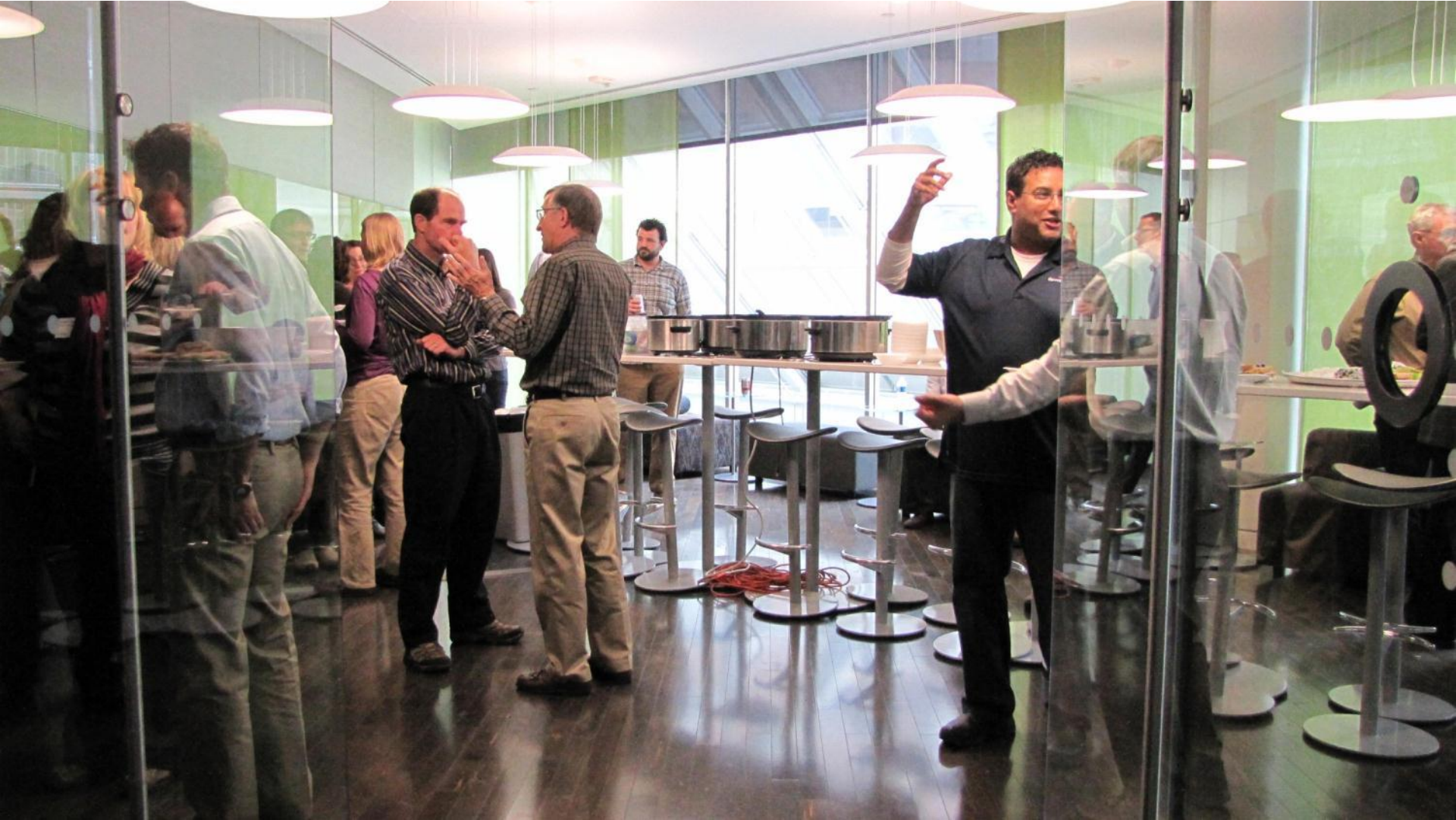
Networking opportunity during break