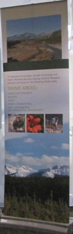
Caribou Workshop 2012 – Calgary, AB