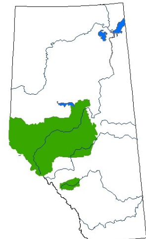
Figure 1. Portions of Alberta with FMF stream and watershed classification data.

With a height of land perspective, there are an infinite number of ways that you can increase your understanding of your land and water resources. If you are interested in attending a workshop on how to begin to use our watershed maps, please contact Richard McCleary. A one-day information session is planned for Tuesday, January 20, 2004 at the Hinton Training Centre. At the workshop we will assess the needs and interests of potential users and then plan for a more in-depth training session on applications of our watershed and stream classification data.